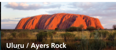
Uluru / Ayers Rock